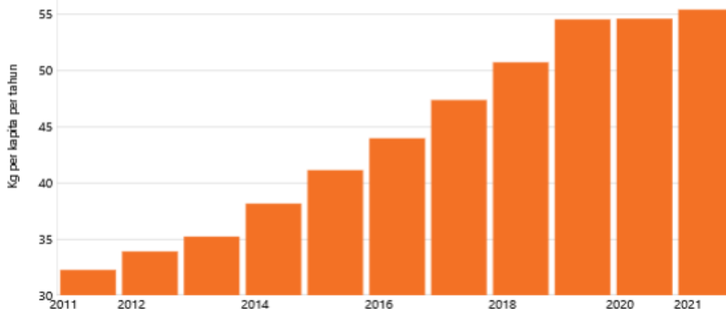
Figure 2. Fish Consumption Rate in Indonesia 2011-2021

Over the past decade, Indonesia's fish consumption has trended upward, rising from 32.25 kg per capita in 2011 to an increase of about 69.17% by 2021. The highest annual growth occurred in 2014 (8.32%, 38.14 kg per capita), while the lowest was in 2020 (0.11%, 54.56 kg per capita), as shown in Figure 2.